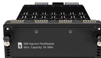
SIM Injector FlexModule (EXM-SIM-BK56)